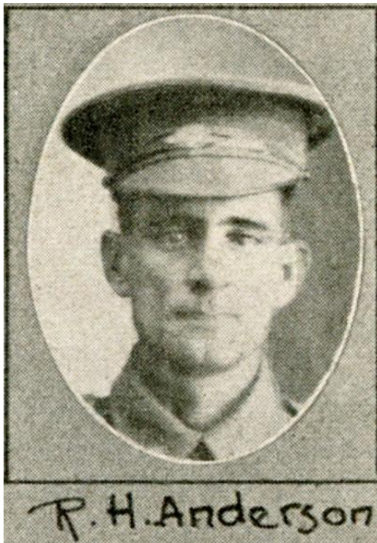
(Queenslander Pictorial – 18 November, 1916)